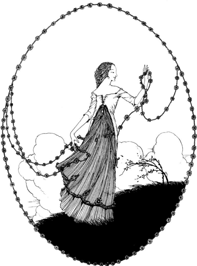
Illustration for The year's at the spring; an anthology of recent poetry ([1920]) by Harry Clarke